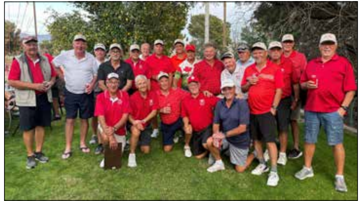
Members of the winning Canadian Ryder Cup team gathered for a group photo, and perhaps a beverage, in celebration of an overwhelming victory over Team USA. While the Canucks were posing, members of Team USA were plotting their revenge.

Prize money was paid to first, second and third-