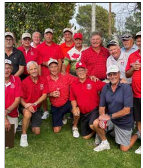
On the cover: One of Second Season Golf Club's most anticipated tournaments for the season is the annual Ryder Cup where players from Canada and the USA spar for bragging rights and an embroidered jacket. This latest victory is the third in a row for the Canadians.

Not sure what the lesson here is, but maybe like the pizza, I'm a bit salty but here to serve.