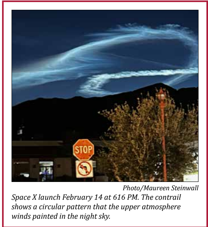
Space X launch February 14 at 616 PM. The contrail shows a circular pattern that the upper atmosphere winds painted in the night sky.

Coming up on Friday, March 13 we are hosting the Guys & Dolls Tournament. Please come out and join us for a fun day of golf, it's a great way to meet new friends!