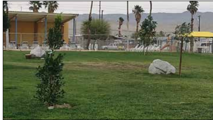
The addition of new trees to the Tri Palm dog park will grow to offer more shade.

"This project means a great deal to our members and their four-legged